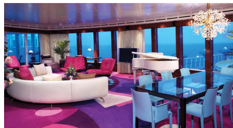
The Haven 3-Bedroom Garden Villa