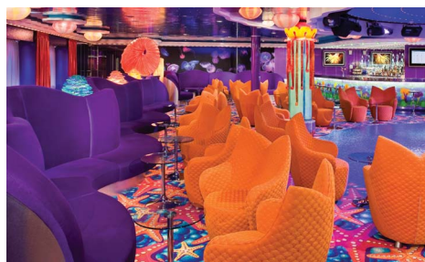
Medusa Lounge & Nightclub

Seating capacity 85 (3,907 sq. ft.) (363 m 2 )