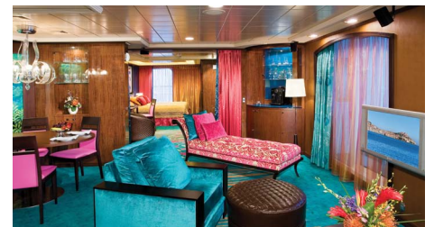
The Haven Owner's Suite with Large Balcony